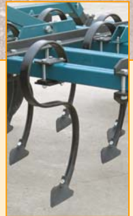
Equip bed shaper with S-tines for light tillage of pre-made beds.