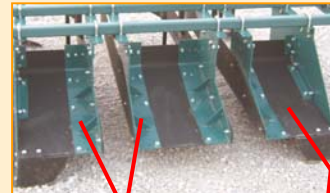
Add re-shaper brackets and shaper pan sections for row crop cultivation on raised beds.