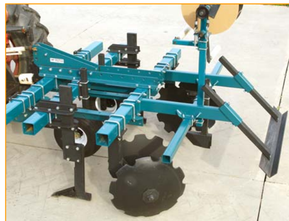
5201 shown with Ripper Shanks, Leveling Bar and Drip Tape Applicator Options

Minimum 45 PTO-HP in loose soil. Tractor needs Category-2 3-point hitch. If adding ripper shanks, allow 25 PTO-HP for disk gangs.