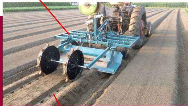
Mount Row Furrowers under the shaper pan

This welded multi-toolbar backbone offers unmatched strength for a modular, bolt-together assembly. Adjust, add or remove attachments as needed to adapt and customize without starting over.