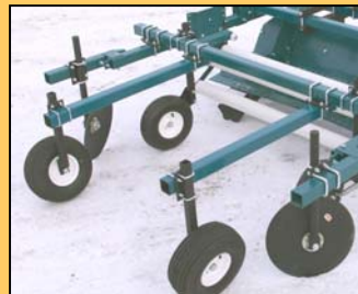
Superior floatation with floating tuck wheels and rear gauge wheels