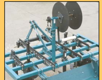
State-of-the-art drip tape application attachments