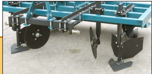
Furrow shanks and shaping disks are standard to fill bed, pull straight and use less power