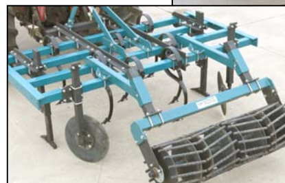
4460-84RB Toolbar Cultivator

Other raised bed equipment handles moderate to heavy residue conditions. Heavy shanks also loosen compacted furrows.