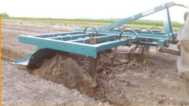
Bed shaper equipped with tillage attachments