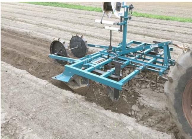
Apply drip tape and/or mark plant locations at final stage of bed conditioning. Bed shaper can also work over-top buried drip tape already in place

Bed Shapers are also fitted with S-tines. A 4-bar toolbar frame provides more clearance between tines. Loosen the top layer of soil on primary beds for the shaper pan to flatten and re-firm bed top with squared shoulders. Retain natural moisture for best tillage and planting without over-working soil. This can provide the finest seedbed in many medium-to-heavy soil types. Also re-work stale beds with little soil turnover or simply control weeds as beds wait for planting. Tillage depth is adjustable.