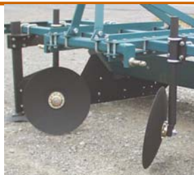
Like "D" Models, also equip with shaping disks to form new beds