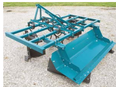
Heavy-duty 4531-T also available