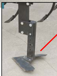
A broader sweep to cultivate furrows is optional

The popular S-tine and rolling basket seedbed cultivator conforms to raised beds. For general cultivation, this is more flexible across varied conditions and can handle moderate crop residue. Lightly work stale beds. Finish primary beds.