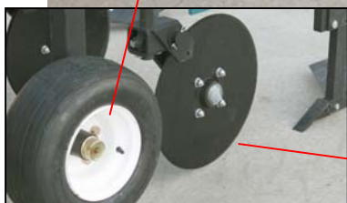
Optional coulters to lead ripper shanks