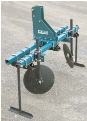
Hilling & Ridging