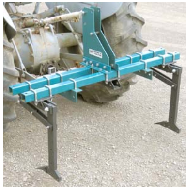
Loosen plastic mulch