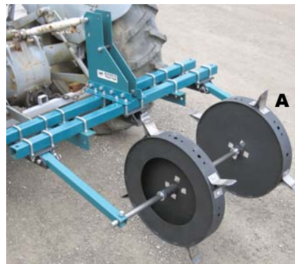
Puncher wheels for planting