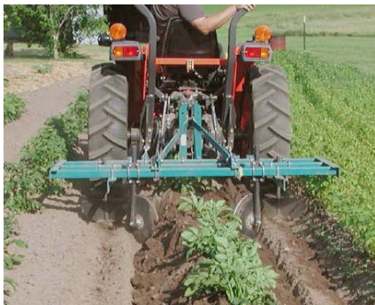
This bed shaper toolbar has the pan removed and hilling disks adjusted to hill potatoes